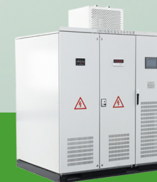
配电箱系列 Box-Type Substation Series