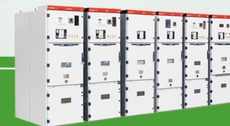
高压成套设备 High Voltage Switchgear Series