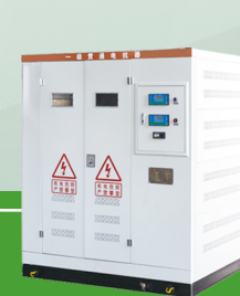
电抗器系列 Reactor Series