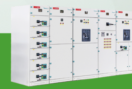
低压成套设备 Low Voltage Switchgear Series