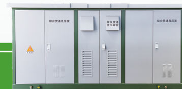
箱式变电站 Box-Type Substation Series